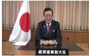
Mr. NAGASAKA Yasumasa State Minister of Economy, Trade and Industry

<Video messages from Japan, the U.S. and the EU in Opening Remarks session>